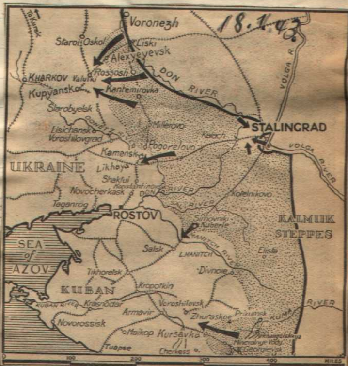
MAP OF SOUTHERN RUSSIA, showing how the Red Army is advancing in all sectors from Voronezh to the Caucasus. It has now crossed the Donetz River near Kamensk.